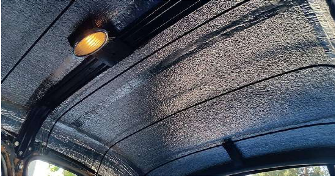
FIG.5: IS A NOISE-ELIMINATING LAYER TECHNOLOGY.