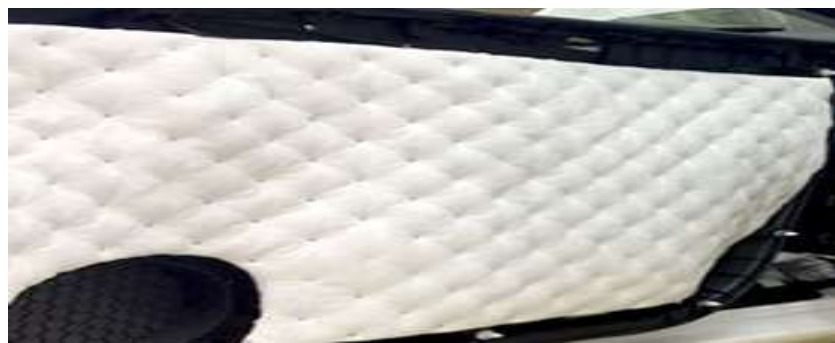
FIG.4: IS A SHOCK-ABSORBING TECHNOLOGY.