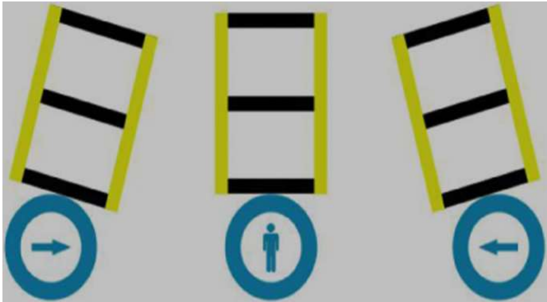
FIG.3: CONCEPT OF SELF-BALANCING.