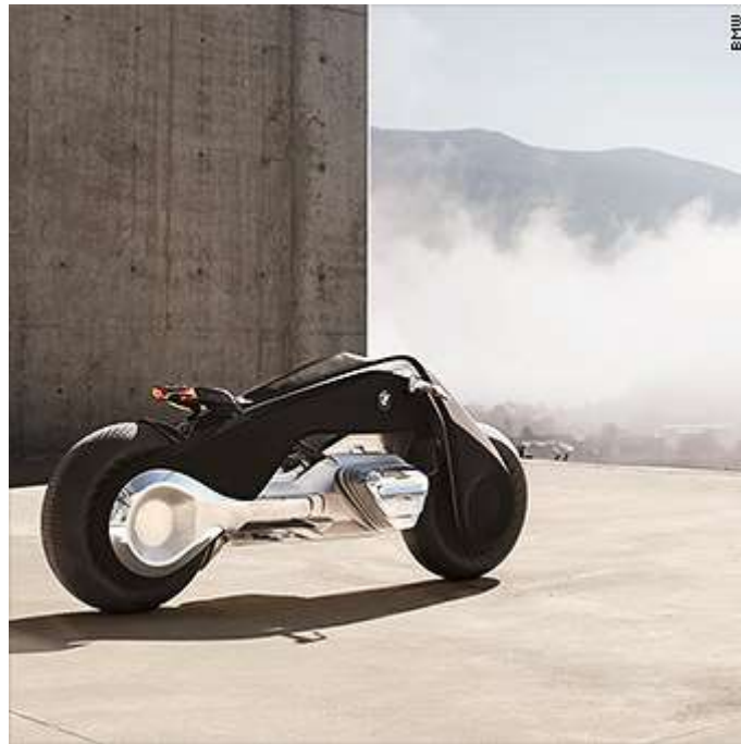
FIG.1: SELF-BALANCING VEHICLE FRAME.